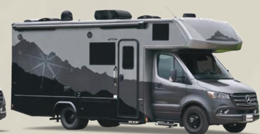
Freedom Dark shown with optional black aluminum wheels