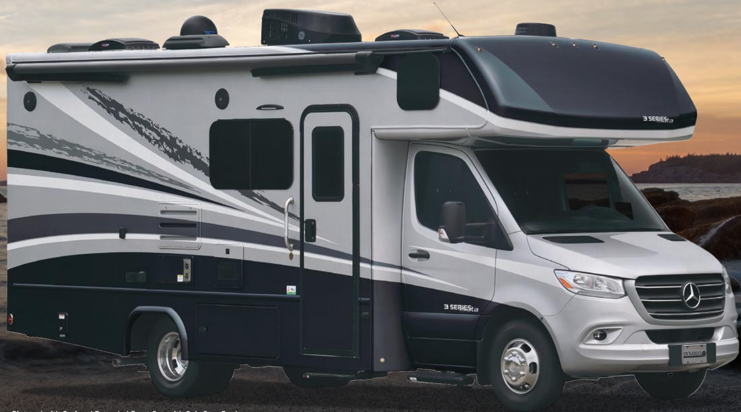
Pictured with Optional Extended Front Cap with Cab-Over Bunk