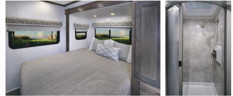
24FW shown with Driftwood II cabinetry and Milano décor.

All information contained in this brochure is believed to be accurate at the time of publication. Please be advised that the stated Standards and Options are subject to change during the model year due to factors outside of the direct control of Dynamax, such as supplier changes/shortages. Dynamax also often makes running changes during the model year to improve reliability, performance, and/or capacity. Please refer to www.dynamaxcorp.com for the most current specifications.