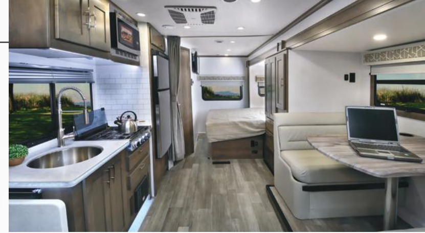
24FW shown with Driftwood II cabinetry and Milano décor.